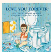
Love You Forever by Robert Munsch