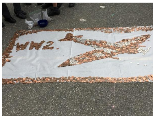
The winning design from Class 3 WELL DONE to all classes!