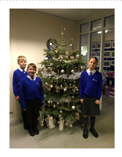
Y6 have taken part in Falmouth's Virtual Christmas Tree Festival this year.

The theme was 'journeys' — Y6 chose to celebrate the traditional aspects of Christmas with the journey of the Mary and Joseph and the Three Kings.